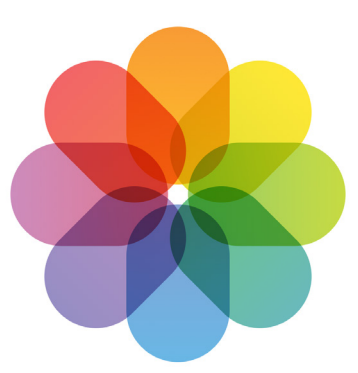
iCloud backs up images and videos in your iPhone's Photos app